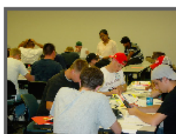
"I like working groups, I learned a lot during the group sessions."