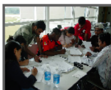
"The support of the teacher's assistants and sharing real world experience was great!"