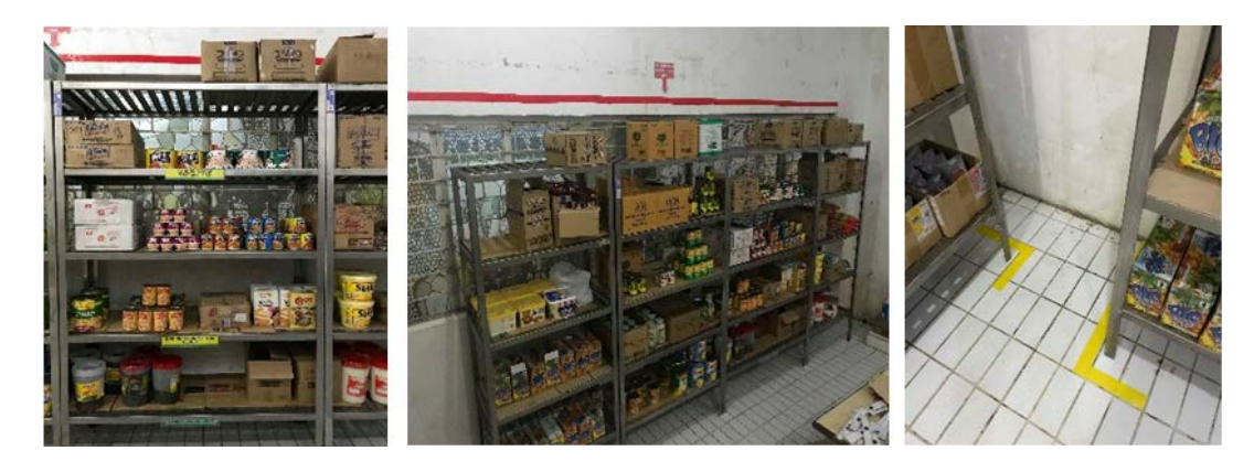
Figure 3: Final condition of the storeroom (snap shots).