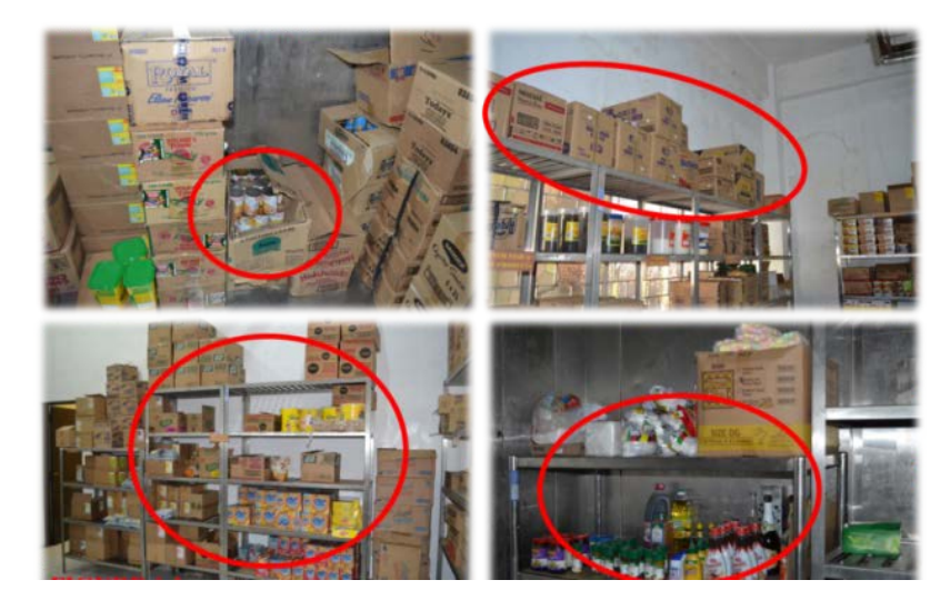
Figure 2: Initial condition of the storeroom.

The 52 out of 60 items in the questionnaire demonstrated significant differences in the functionality, food safety, general 5S application and lot traceability in the storeroom, which contributed to the overall improvement of the food storage and inventory management of the institution. All mean ratings gave significant differences. The results of the study have been presented and discussed with the Faculty of Industrial Engineering of Saint Louis University, and with the Commanding Officer and staff of the military cadet mess.