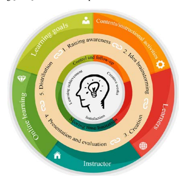
Figure 2: Model of on-line instruction with design thinking.

As mentioned earlier, the model presented in this article has been based on the ADDIE framework [8]. Also, design thinking [4-6] and creative thinking [9-11] have been incorporated into the model as illustrated in Figure 2: