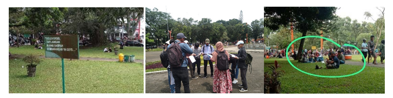
Figure 1: Observations in the town square.

Environmentally unfriendly behaviour is most prominent in damaging vegetation, especially trampling of grass and plants. In the town square, it is not allowed to step on the grass as it affects its growth. However, during their investigation, students found children running, sitting on the grass and playing in the garden. The observations also show that the road is widely used as a place to sell, the traders occupy almost the entire entrance area of the square, thus disturbing the visitors.