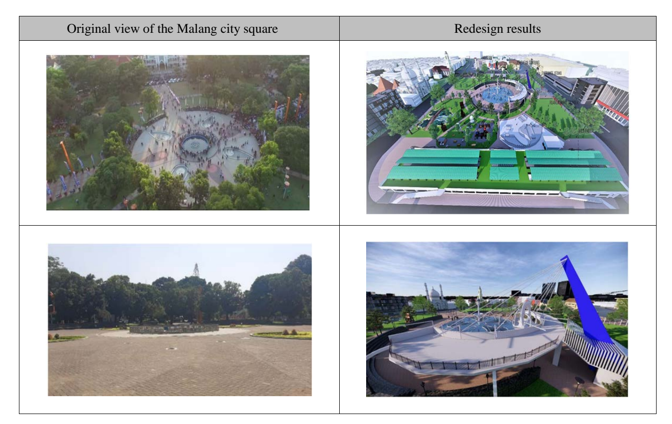
Table 3: Appearance of the city parks before and after the redesign.