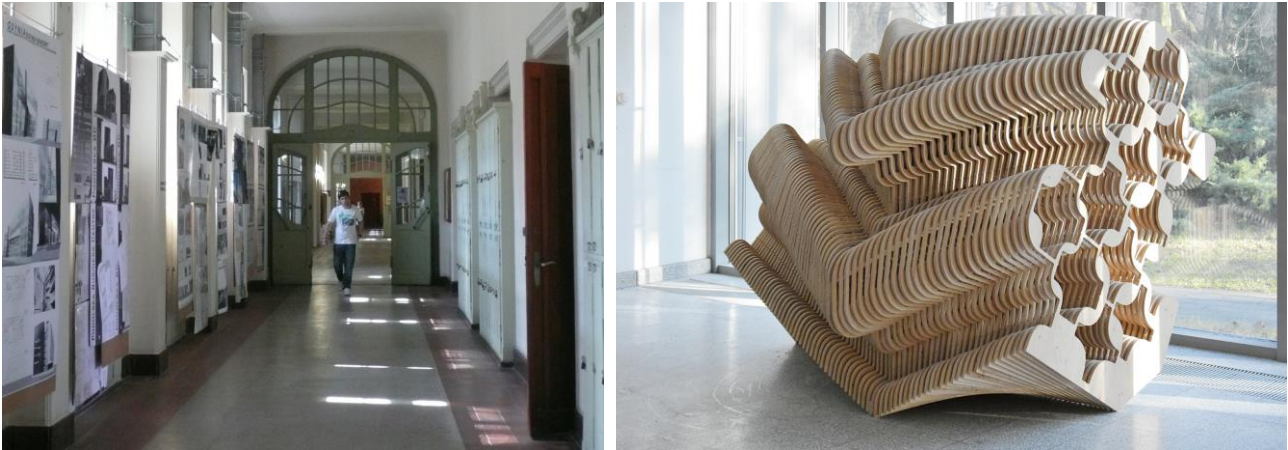
Figure 2: Long corridors as a space for circulation according to the 19th Century French Academy tradition and the in-between space for experimentations - 3D modelling laboratory.

Strict symmetry was used in the plan of the main building, with long corridors that enabled circulations and provided entrances to utility spaces - lecture rooms with rigid rows of desks facing slightly elevated stands for lecturing ex-cathedra. The separation between spaces for movement and spaces for static positions was rigorous according to the French theory. The strict layout of long corridors and sequence of rooms did not allow for any unambiguous spaces. Despite the strict division between circulation spaces and learning spaces and the rigid arrangement of learning units, the grand scale of the space allows today for using corridors as a venue for exhibitions (Figure 2).