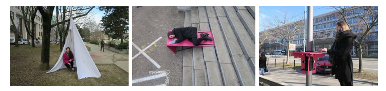
Figure 6 - Figure 8: Examples of the implemented small interventions within the teaching of the subject Public Spaces (Authors: students of FAD-STU 1st year of Master's level - year 2022/2023).