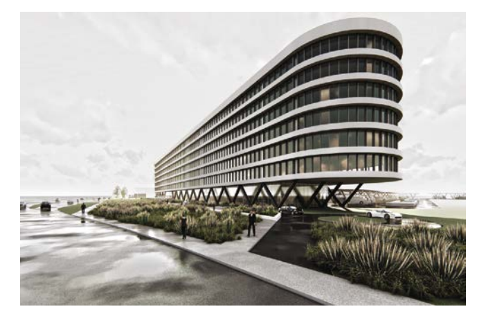
Figure 3: Final project proposal 1 (Student group: A. Roguszewska, S. Sitniewska, P. Stępińska, M. Cymanowski).

The projects were significantly varied in approaches (see Figure 3 and Figure 4), and addressed problems initially not indicated in the project brief. For example, some of the design solutions were specifically oriented towards solving ecological problems of facilities of the type, such as water and energy management. Another solution incorporated social functions into the project; for example, a kindergarten for employees' children, community centres, as well as social gardens and workers' canteens.