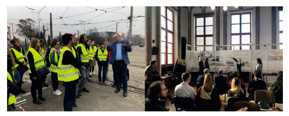
Figure 2: Field trip, studies, research and discussions conducted within the studies on architecture design for Master's students in the academic year 2019/2020 (Photographs: J. Borucka).

Another element was the organisation of classes in the form of a competition. In creative endeavours, competition has a positive effect on students' creativity.